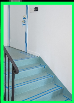
Mask off areas